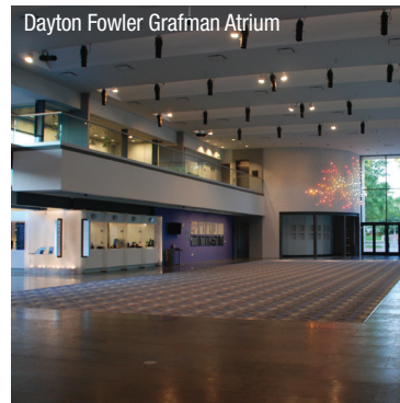
Dayton Fowler Grafman Atrium