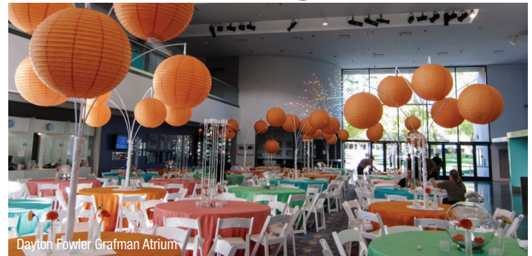
Dayton Fowler Grafman Atrium