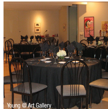
Young @ Art Gallery