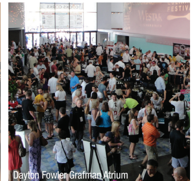
Dayton Fowler Grafman Atrium